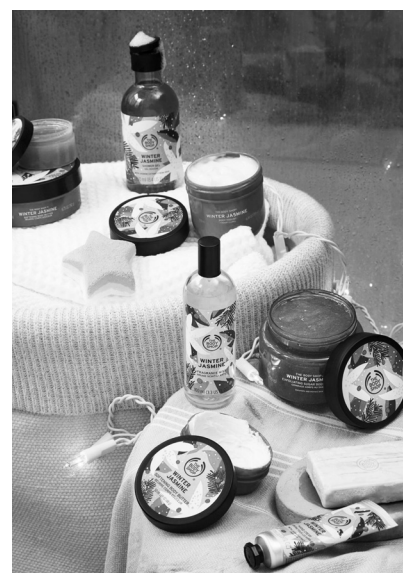
The Special Edition Winter Jasmine Range is fresh, crisp, and white as a winter's morning. Line includes Winter Jasmine shower gel, body scrub, body yoghurt, body butter, hand cream, and starry bath bomb.