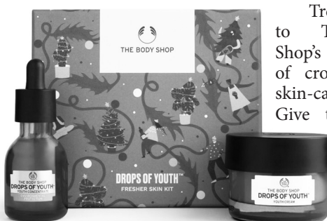
Give the gift of healthier, fresher-looking skin with the Drops of Youth Fresher Skincare Kit, including a Youth Concentrate and Day Cream.

Make someone feel real special with The Body Shop's Bath and Body gifts that come in Big Gift Boxes, Little Gift Boxes filled with a mini collection of body care treats, and cute little gift pouches of nourishing treats. These come in irresistible scents: Moringa, Satsuma, Strawberry, British Rose, Shea, and Almond Milk and Honey.