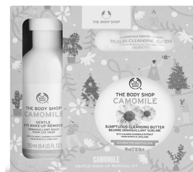
Wave goodbye to party make-up this Christmas with The Body Shop's gentle vegan, make-up removal made for sensitive skin.