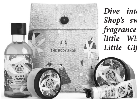
Dive into The Body Shop's sweetest festive fragrance with this little Winter Jasmine Little Gift Box. With four skin-softening body care picks.