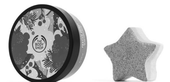
Drop the Festive Berry Starry Bath Bomb into your tub for a fragrant and berry-colored water then slather on the Festive Berry Body Butter to keep skin feeling softer and smelling sweet.

Christmas with The Body Shop's superhero Drops of Youth™ Fresher Skin Kit or Little Gift Box.