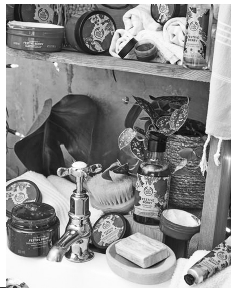
Sweet-smelling, tangy and as Christmassy as a sprig of holly, The Body Shop's Special Edition Festive Berry Range will surely give you all the festive feels.