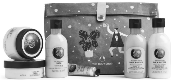
Hydrate your skin and hair with the Nourishing Shea Ultimate Gift Bag featuring six haircare and body care favorites.

Count down to Christmas day with our Make It Real Advent Calendar. It's jam-packed with unexpected