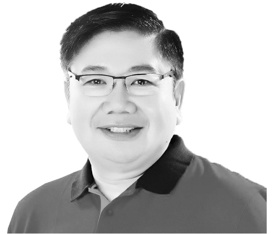
Mayor Ony Ferrer General Trias, Cavite

Vol. V No. 03 December 21-27, 2020 P 10.00 ISSN No.: 2672-3034