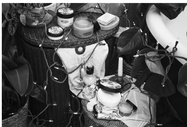
It's Warm Vanilla season as the warm, sweet, and cosy fragrance is back for your Christmas pampering. The Special Edition Warm Vanilla Range includes a shower gel, body scrub, body yoghurt, body butter, hand cream, starry bath bomb, and sugar lip scrub.

treats to uplift, pamper and rejuvenate.