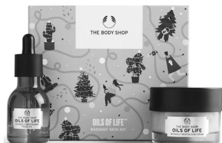
Festivities taking their toll? The Oils of Life Radiance Skin Kit with its intense nourishing duo is just the thing for skincare aficionados.