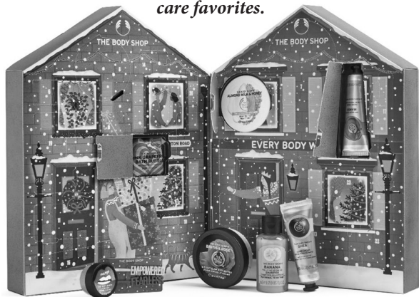
Count down to Christmas with a daily beauty treat with the Make It Real Together Advent Calendar. Discover 24 handpicked surprises from The Body Shop's new and favorite ranges.