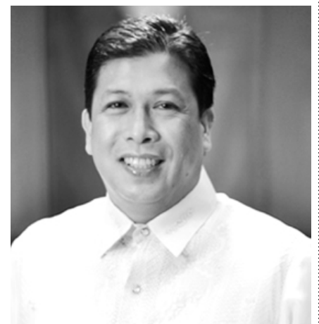
Vice Mayor Ony Cantimbuhan Imus City, Cavite