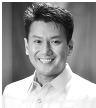
Mayor Emmanuel Maliksi Imus City, Cavite