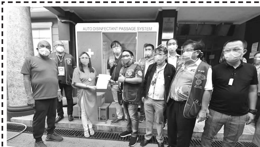
TURN OVER OF AUTO DISINFECTANT PASSAGE SYSTEM sponsored by the LIONS CLUB. The machine is positioned at the main entrance of the city government building to ensure that no client and stakeholder may be able to gain access/entry to transact their business compromising the health and well-being of employees who have painstakingly reporting for duty to be of service since the onset of the pandemic.

Among those visited were evacuation centers located at Malanday Elementary School and Concepcion Integrated School which houses 481 and 393 families respectively.