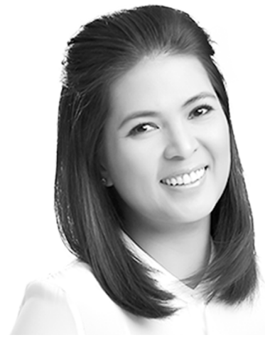
Mayor Lani M. Revilla Bacoor, Cavite

Vol. IV No. 49 November 9-15, 2020 P 10.00 ISSN No.: 2672-3034