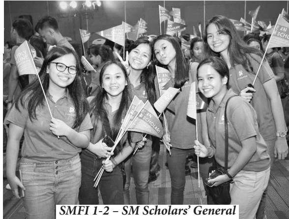
SMFI 1-2 - SM Scholars' General Assembly last 2019.