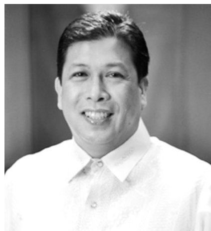
Vice Mayor Ony Cantimbuhan Imus City, Cavite