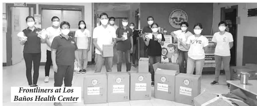
Frontliners at Los Baños Health Center