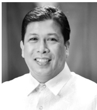
Vice Mayor Ony Cantimbuhan Imus City, Cavite