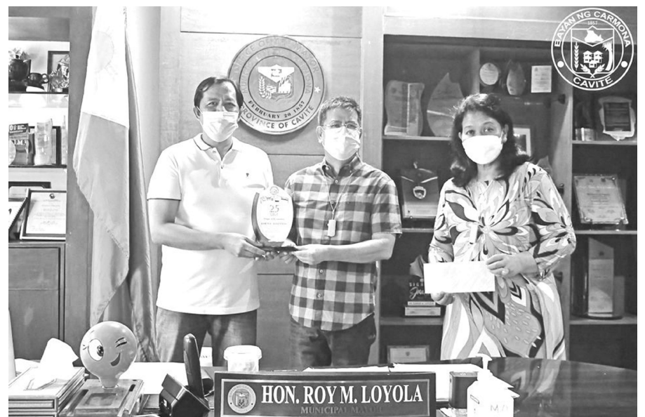
Carmona LGU awards outstanding local government employees. On

September 28, 2020, the Municipal Government of Carmona held an online awarding ceremony to recognize outstanding local government employees as well as employees who have served the community for 10, 15, 20, 25, and 30 years in celebration of Civil Service Month.