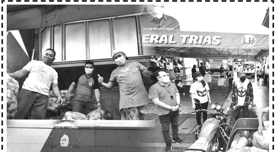
MGA GULAY PARA SA MGA FRONTLINERS HANDOG NG LUNGSOD NG GENTRI. Namahagi ang Pamahalaang Lungsod ng General Trias ng mga gulay sa mga Barangay Front Liners bilang pagsuporta sa kanilang mga gawain, at pagsasalamat sa kanilang kontribusyon sa kampanya laban COVID-19. Maraming salamat sa Dyban Farms and Vegetable Supplies ng Mankayan, Benguet sa kanilang kagandahang loob.