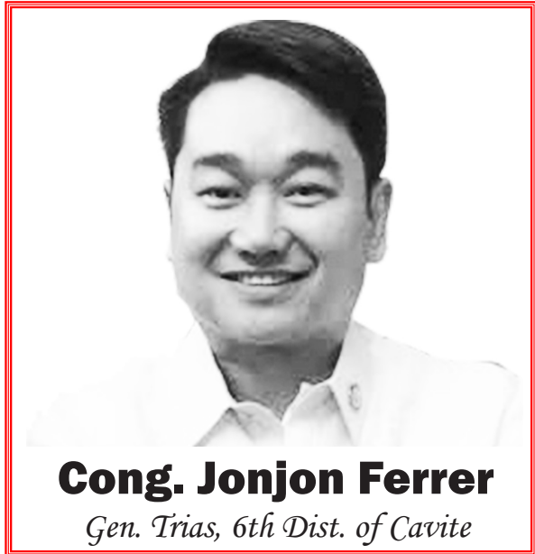
Cong. Jonjon Ferrer Gen. Trias, 6th Dist. of Cavite

Vol. IV No. 40 September 7-13, 2020 P 10.00 ISSN No.: 2672-3034