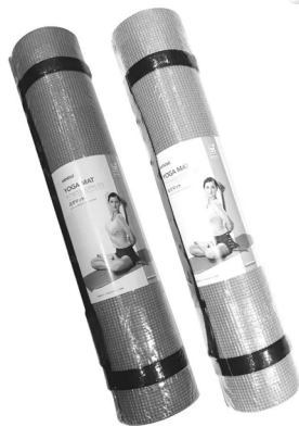
Stay fit and active with Miniso's yoga mat.