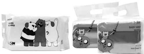
Practice good hygiene and proper disinfection at home and at work with these Miniso wet wipes.