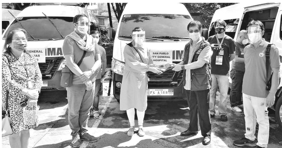
Dalawang lungsod sa Cavite ang nakatanggap ng bagong Nissan N350 ambulance mula sa Department of Health (cont. P.2)