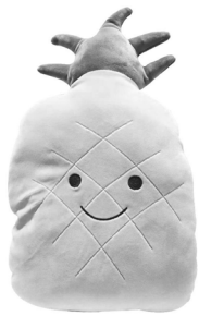
Bright and endearing pineapple stuff toy. Available at Miniso.