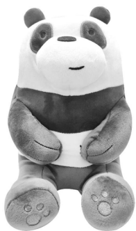
Adorable and fluffy Panda We Bear Bears stuffed toy from Miniso.