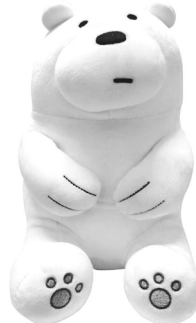
Huggable Icy stuffy toy of We Bear Bears available at Miniso.