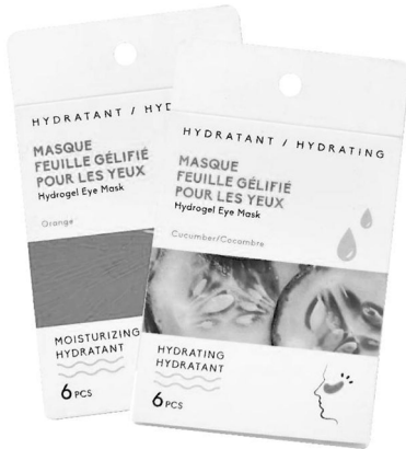
Reduce your dry skin, dark skin and fine lines around the eyes with these moisturizing Hyrdogel eye masks from Miniso. Available in orange and cucumber.