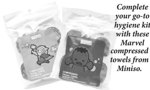
Complete your go-to hygiene kit with these Marvel compressed towels from Miniso.