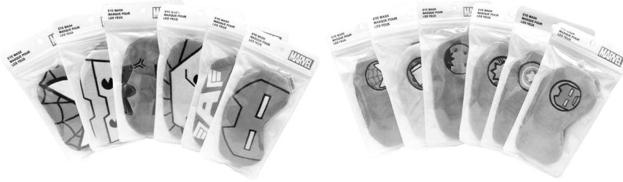
Have a goodnight's sleep with these Marvel eye masks from Miniso.

Miniso brings in fun with its cute and colorfully designed