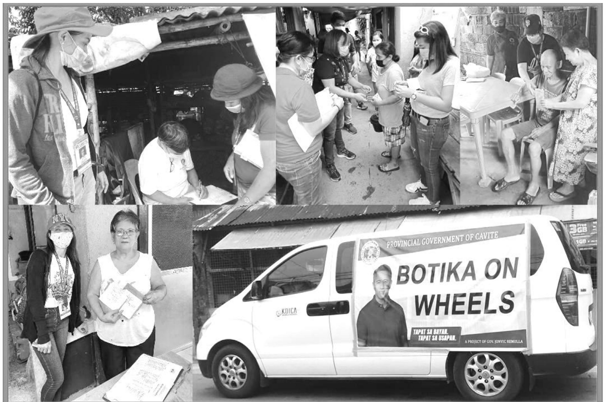
Mayor Jun Dualan as

As of June 29, 2020, eight thousand one hundred forty (8,140) individuals benefitted from the Botika on Wheels program. The activity was made possible with the assistance of Provincial Health Office, Maragondon Mayor Reynaldo Rillo, Cavite City Mayor Bernardo Paredes, ABC President Apple Paredes and Naic