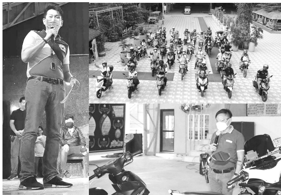
IMUS CITY, Cavite -- The local government here thru the Department of Education-Imus have been preparing for the School Year 2020-2021 which opens August 24, 2020 with the