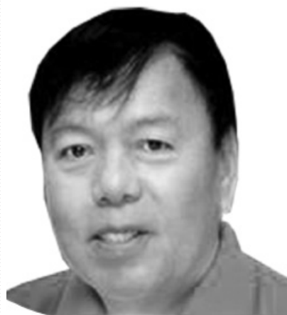
Mayor Nonong Ricafrente Rosario, Cavite