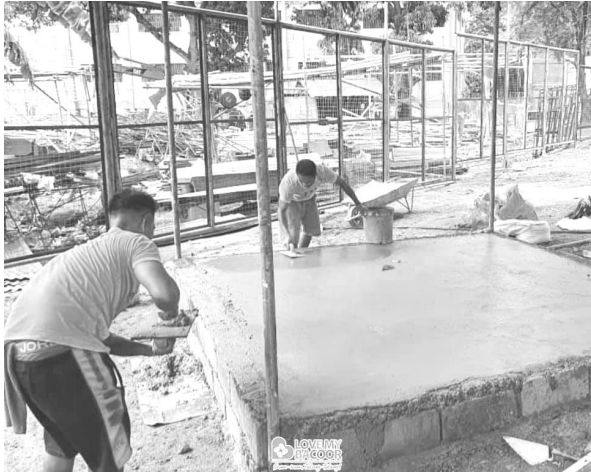
The Kabalikat Hall Duty post/Multi-purpose area was constructed to provide BJMP personnel with more conducive work space and at the same time, utilize as multi-purpose area for service providers, visitors, and clientele.

BACOOR CITY, Cavite --The new Bacoor City Jail Male Dormitory (BCJ-MD), a newly completed jail facility in the city is now host to 1,356 Persons Deprived of Liberty (PDLs) transferred from the old cramped facility.