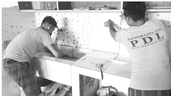
The temporary kitchen was put-up to adequately provide the needed food requirements of the PDLs upon transfer to the new facility, pending the construction of the permanent kitchen.

The "Kabalikat Hall" Duty post/Multi-purpose area was constructed May 2020, to provide BJMP personnel with more conducive work space and at the same time, utilize as multi-purpose area for service providers, visitors,