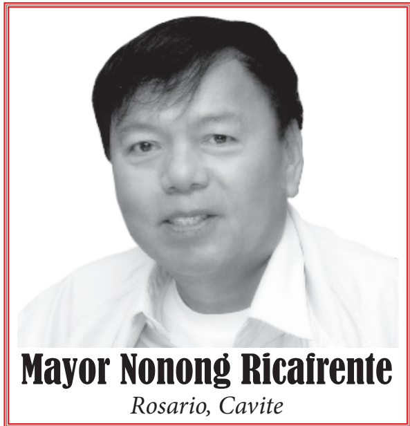
Mayor Nonong Ricafrente Rosario, Cavite

Vol. IV No. 26 June 1-7, 2020 P 10.00 ISSN No.: 2672-3034