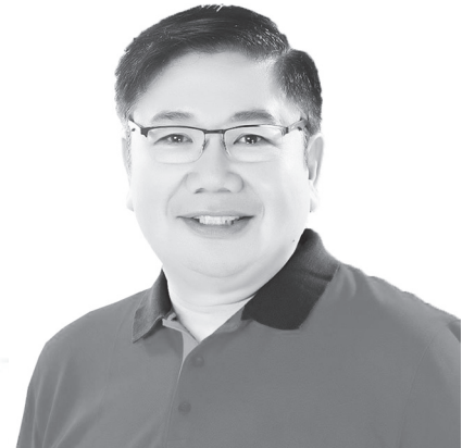
Mayor Ony Ferrer Gen. Trias, Cavite