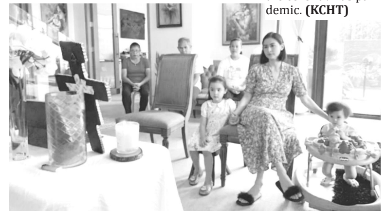
Marian instills in her family and kasambahay the importance of praying together and to have faith in God which her nanay taught her.