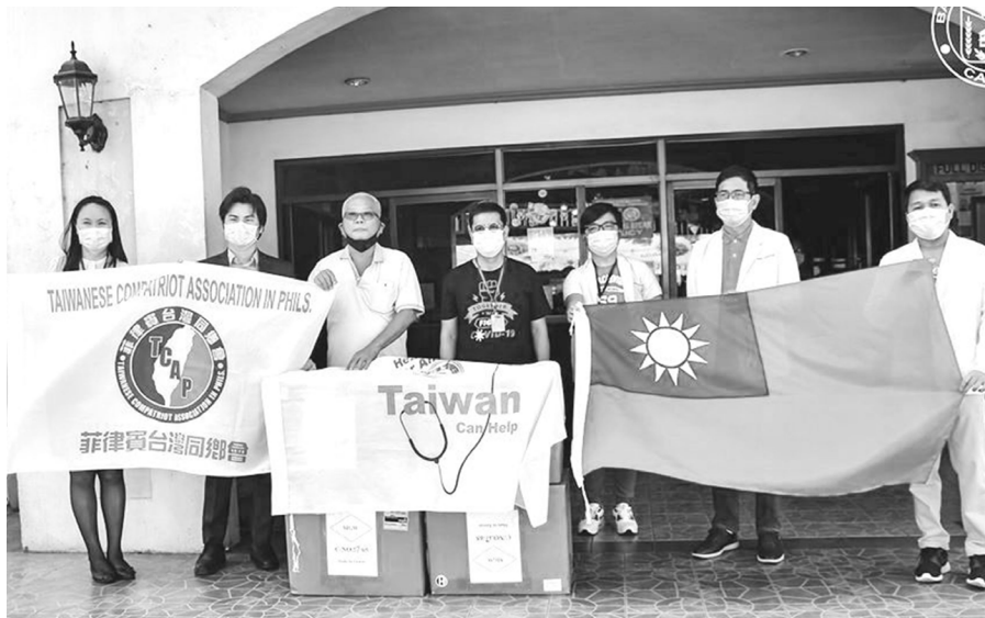
Donors continue the spirit of #BayanihanMunaLagi this COVID-19 season. Donors from the public and private sectors continue to help Carmona frontliners through various donations.