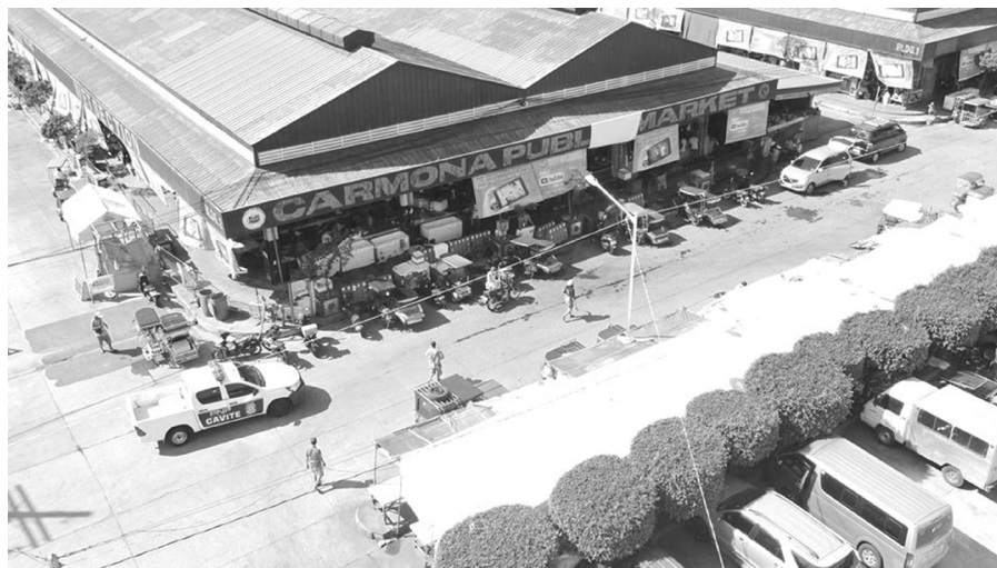
Carmona LGU delivers situation reports through drone shots. In line with the local government's mitigation efforts to prevent coronavirus disease (COVID-19) in the community, drone shot situation report at Carmona Public Market was released on May 13, 2020 for strict monitoring of the implementation of the local government's social distancing measures.