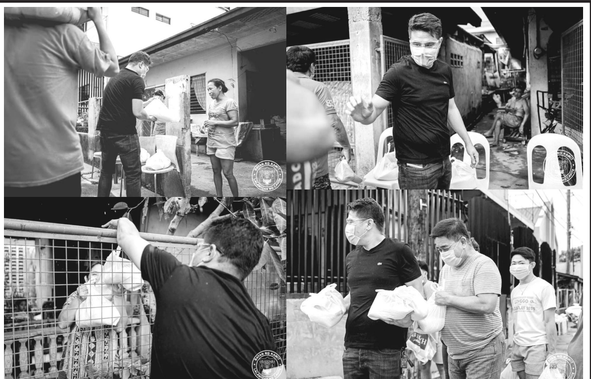
Together with SAO Jerry Jarin and several municipal staff, Mayor Angelo Aguinaldo visited Brgy. Toclong (Proper) to distribute the fourth wave of relief goods to its residents. They delivered the said relief goods directly to the houses of the residents in order to minimize the risk of exposure to COVID-19. (KPIO)

Subscription Rates: 1 year 52 Issues = Php 520.00 Legal Notices: 1 col. Per cm. rates = Php 160.00 Advertisement Rate: Per column = Php 200.00