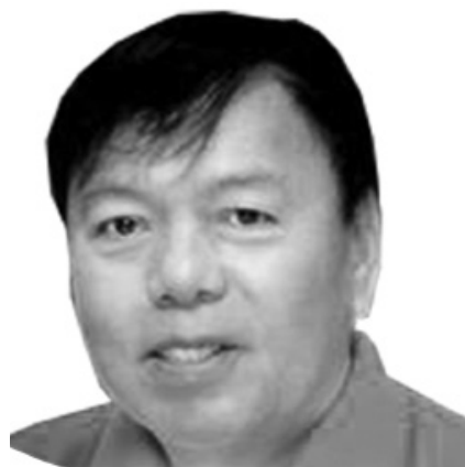
Mayor Nonong Ricafrente Rosario, Cavite