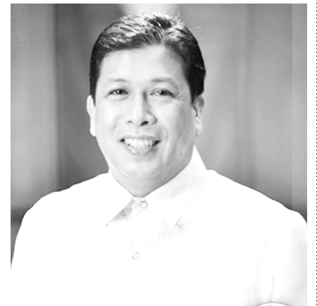
Vice Mayor Ony Cantimbuhan Imus City, Cavite