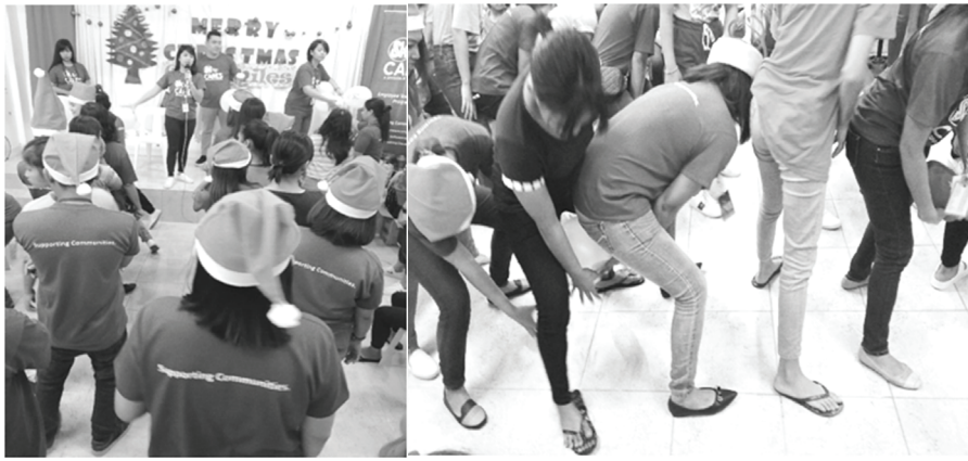
Beneficiaries and employees actively participated during the exciting parlor games.

During this season of gift giving, SM City Calamba Administration employees brings cheers to the members of the community through various Christmas activities.