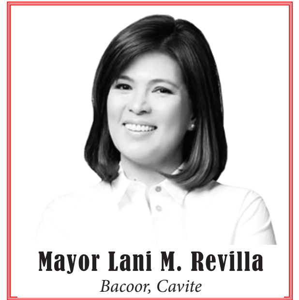
Mayor Lani M. Revilla Bacoor, Cavite

Vol. IV No. 04 Dec. 30,2019-Jan. 5, 2020 P 10.00 ISSN No.: 2672-3034