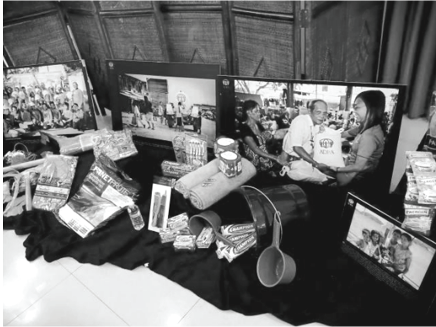
Photo shows a display of Adventist Development and Relief Agency's various assistance projects during the first annual banquet for a cause at Hotel Dominique in Tagaytay City on December 10, 2019.

TAGAYTAY CITY, Cavite -- A non-government organization (NGO) announced its plans to implement more projects that will assist and improve the social development of families and individuals frequently affected by disasters particularly those living in the vulnerable communities in the country.