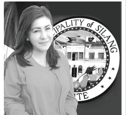
Mayor Socorro Rosario "Corie" F. Poblete Silang Cavite