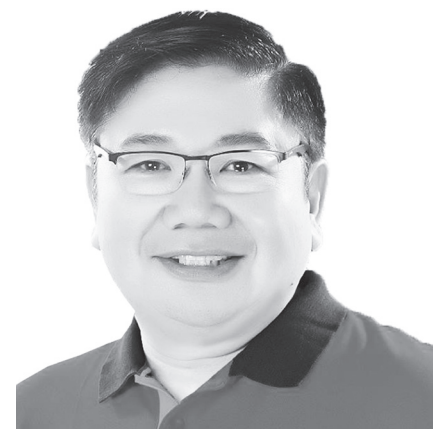
Mayor Ony Ferrer General Trias, Cavite