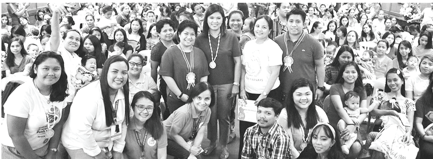
Hundreds of nursing mothers in the province joined HAKABitenya! Year 2, a simultaneous latch-on activity in celebration of the breastfeeding awareness month, held on August 30, 2019 at the Ceremonial Hall of the Provincial Capitol in Trece Martires City.