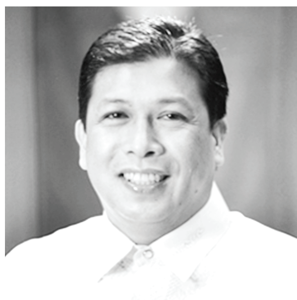
Vice Mayor Ony Cantimbuhan Imus City, Cavite