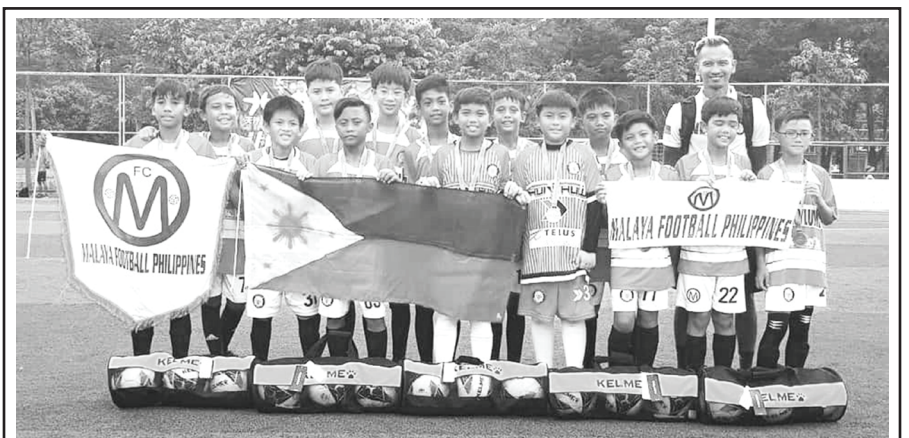
CONGRATULATIONS to the Junior Philippine Team, 2nd runner up in the 5th Futian Cup International Junior Football. Kudos . WE ARE PROUD OF YOU.

Subscription Rates: 1 year 52 Issues = Php 520.00 Legal Notices: 1 col. Per cm. rates = Php 160.00 Advertisement Rate: Per column = Php 200.00