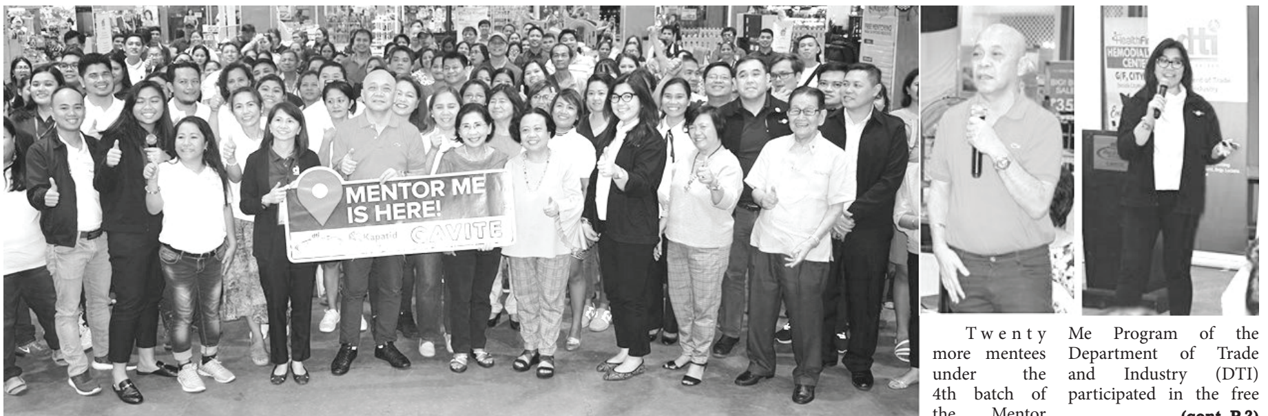
Twenty more mentees under the 4th batch of the Mentor Me Program of the Department of Trade and Industry (DTI) participated in the free (cont. P.2)