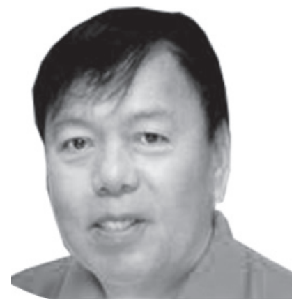
Mayor Nonong Ricafrente Rosario, Cavite