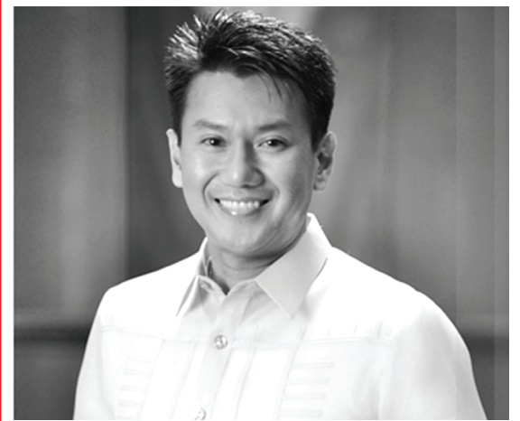
Mayor Emmanuel Maliksi Imus City, Cavite