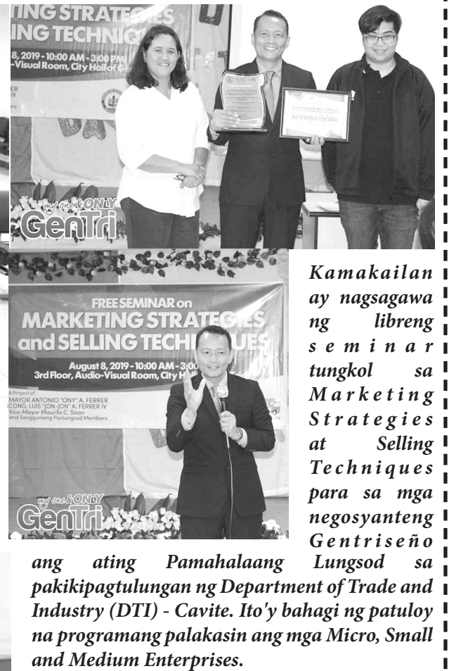
Kamakailan ay nagsagawang libreng seminar tungkol sa Marketing Strategies at Selling Techniques para sa mga negosyanteng Gentriseño ang ating Pamahalaang Lungsod sa pakikipagtulungan ng Department of Trade and Industry (DTI) - Cavite. Ito'y bahagi ng patuloy na programang palakasin ang mga Micro, Small and Medium Enterprises.