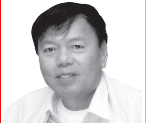
Mayor Nonong Ricafrente Rosario, Cavite