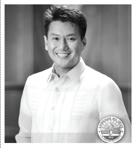
Mayor Emmanuel Maliksi Imus City, Cavite