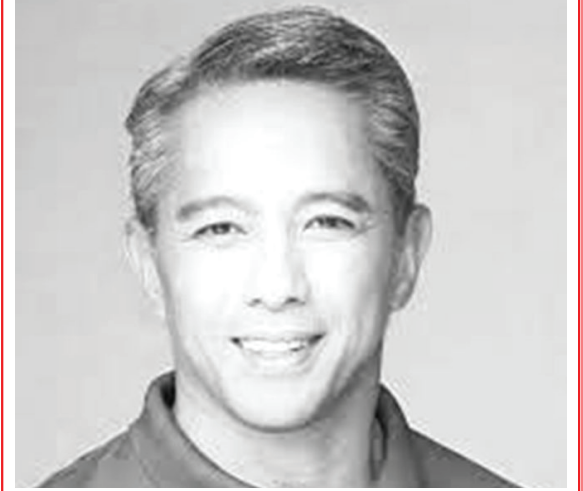
Gov. Jonvic Remulla Province of Cavite

Vol. III No. 34 July 29-Aug. 4, 2019 P 10.00 ISSN No.: 2672-3034