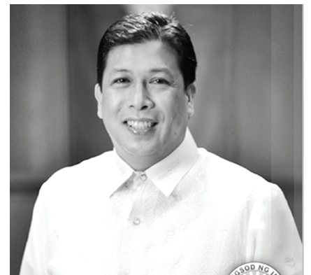
Vice Mayor Ony Cantimbuhan Imus, Cavite