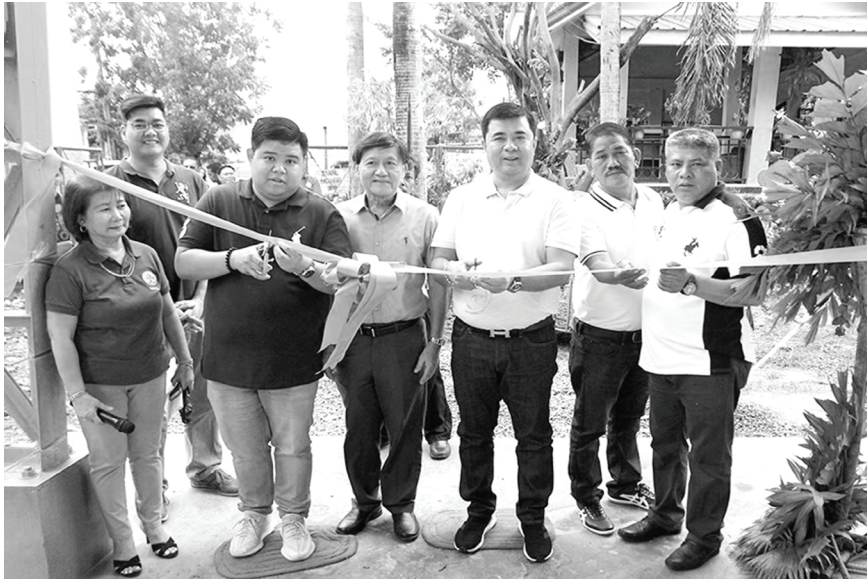
Inauguration and Blessing Ceremony of Covered Court at Vallejo Place, Brgy. Pasong Buaya II with Cong. Alex "AA'Advincula.