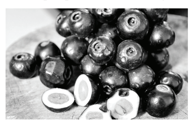
Other name: Black Plum Scientific name: Syzygium cumini Family: Myrtaceae Origin: India, Burma, Sri Lanka and the Philippines

Decoction powdered seeds are taken in for diarrhea