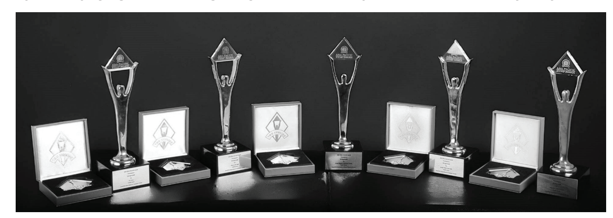
SM South Luzon scored four Silver awards for its Dinos in the Mall, Jungle Safari in the Mall, Pet Party campaigns (Innovation in Consumer Events Category) and Grand Magical Christmas Event Campaign (Innovation in Entertainment Events Category); and one Bronze awards for Supreme E-Sports Brawl campaign (Innovation in Consumer Events Category) – at the prestigious 2019 Asia-Pacific Stevie Awards night, recently held at the InterContinental Hotel in Singapore. These wins were five of the 45 Stevie Awards received by SM Supermalls that garnered the company with the highly coveted Grand Stevie for 'Most Honored Organization.'

SM South Luzon bagged four Silver Stevies in the prestigious 2019 Asia-Pacific Stevie Awards for its Pet Party, Jungle Safari in the Mall, Dinos in the Mall campaigns (Innovation in Consumer Events Category) and Grand Magical Christmas Event Campaign (Innovation in Entertainment Events Category) at the recently concluded awards night, held at the InterContinental Hotel in Singapore. SM South Luzon received one Bronze awards for its Supreme E-Sports Brawl campaign (Innovation in Consumer Events Category).