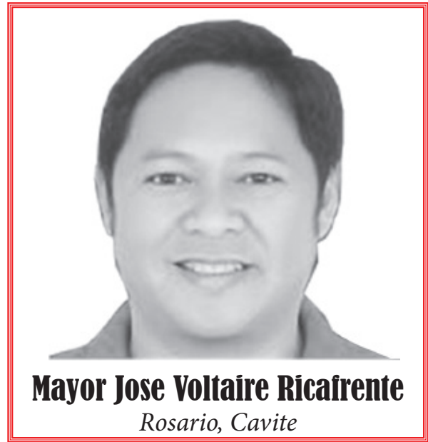
Mayor Jose Voltaire Ricafrete Rosario, Cavite

Vol. III No. 27 June 10-16, 2019 P 10.00 ISSN No.: 2672-3034