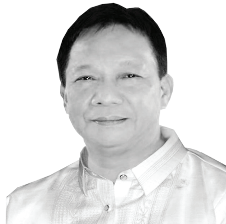
Mayor Junio Dualan Naic, Cavite