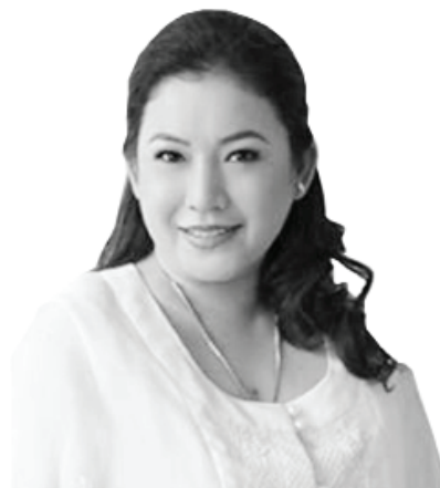
Mayor Omil Poblete Silang, Cavite