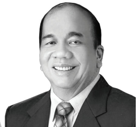
Mayor Pidi Barzaga Dasmariñas, Cavite