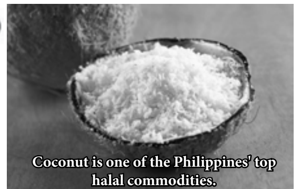
Coconut is one of the Philippines' top halal commodities.