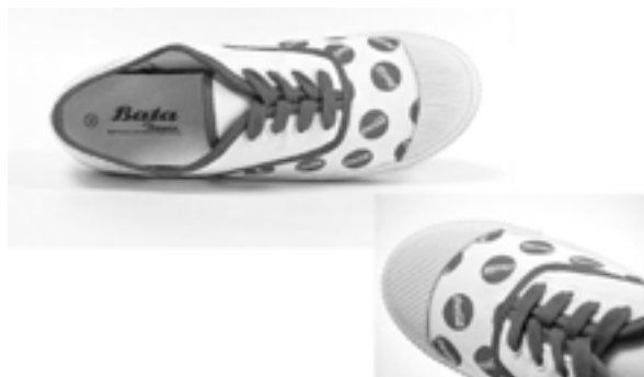
Bata and Coca-Cola's collaboration features the Coca-Cola red dot logo all over the front upper of the white canvas shoes with matching red piping and laces.

The Bata Tennis shoe has been manufactured since 1936 in India for school children to wear for their Physical Education classes and continues today to be one of the brand's best-selling shoe.