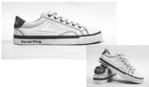
The Real Thing: Fun designs in the Bata Hotshot and Coca-Cola collaboration

Global brand Bata's Bata Heritage partners with Coca-Cola for an iconic capsule collection that puts a fresh spin on the legendary Bata Tennis and Hotshot styles. Coca-Cola—the second best-known word around the globe after 'OK'—shares with Bata Heritage its distinctive red and white colors as well as values of