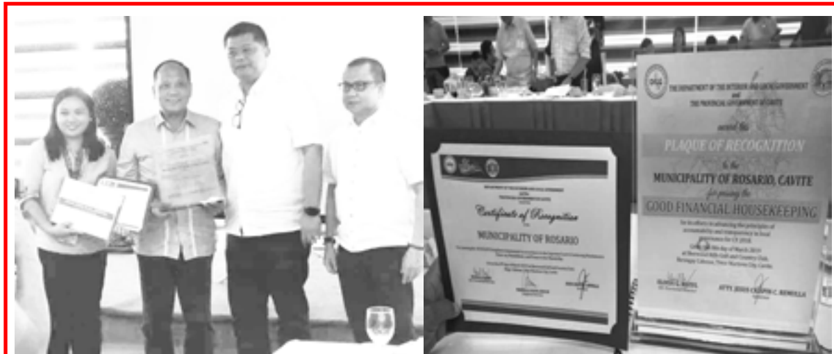
CONGRATULATIONS! The Municipality of Rosario, Cavite received recognitions last Friday, March 8, 2019 from DILG and Provincial Government of Cavite namely: Seal of Good Financial Housekeeping and Outstanding LGU Performer in the Compliance Audit for the Mandamus Order to clean and rehabilitate Manila Bay.