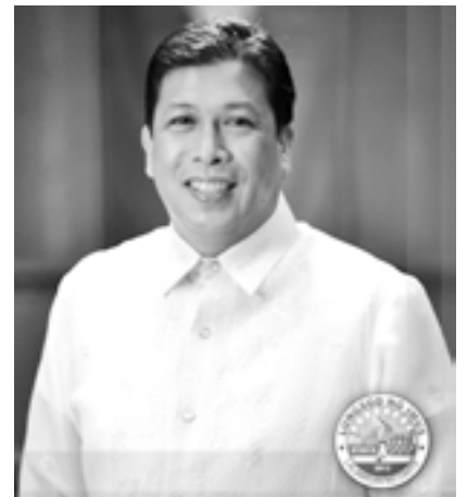
Vice Mayor Ony Cantimbuhan Imus City, Cavite