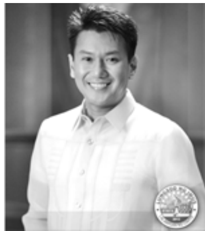
Mayor Emmanuel Maliksi Imus City, Cavite