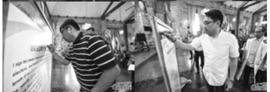
Mayor Ony Ferrer , Vice-Mayor Morit Sison, and Congressman Jonjon Ferrer 2019 Midterm election unity walk and peace covenant signing.