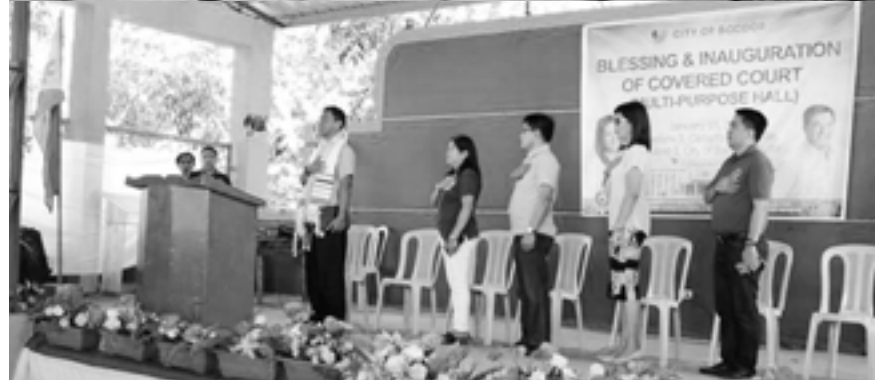
Bacoorenos would be happy to know of the blessing and inauguration of a new covered court at Camella Springville in Molino 3. Mayor Lani Mercado Revilla was present during the ceremony alongside city and barangay officials.