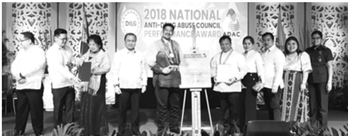
Ang 2018 National Anti-Drug Abuse Council (ADAC) Performance Award na ginanap noon